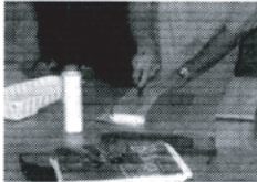
Glue strips of veneers to start creating a board.