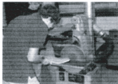
After cutting out the design, rough sand it on the belt/disk sander.