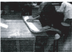
Measure and draw a centerline and trace a pattern on the "wafer."