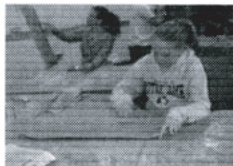
Hand sand the board; starting with a rough grit and ending with a fine grit.