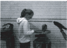
Cut the pattern out on the jigband saw.