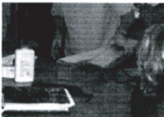
Put strips of veneers in a mold.