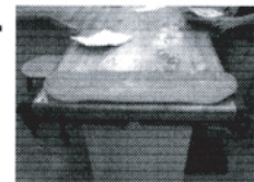
Then the sanded board is polyurethaned. Paint the board to your liking.