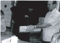
Press the mold.